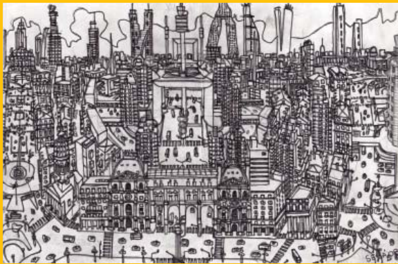
Art by NAEMI